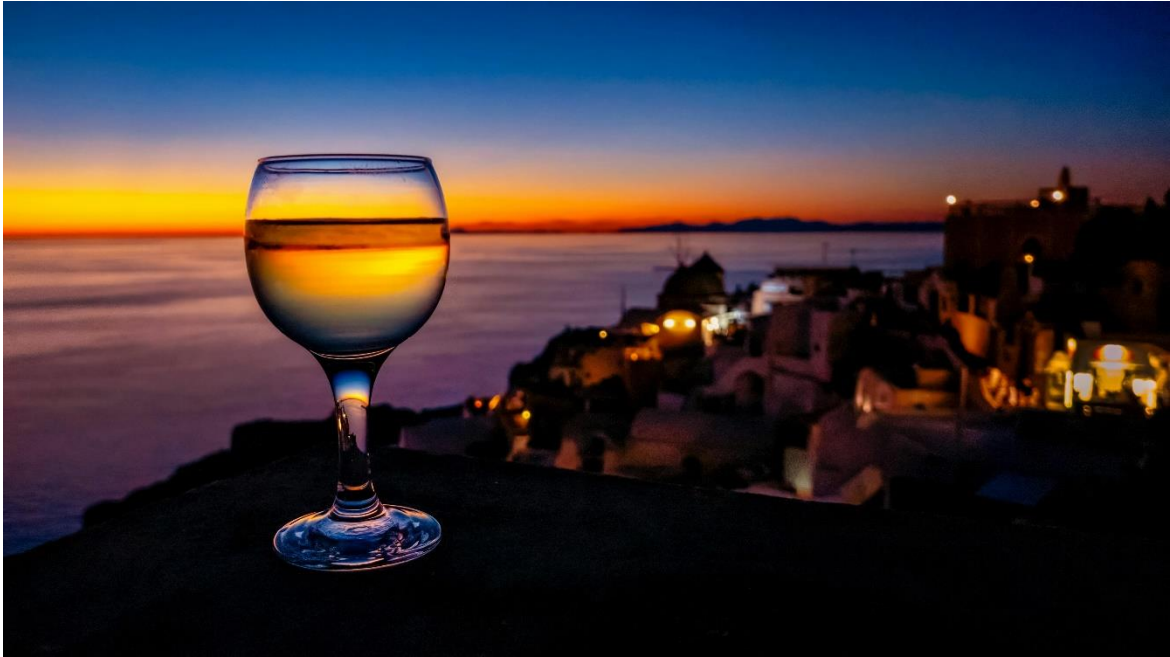
Santorini island is famous for its distinctive wines, which can be savored while enjoying stunning views